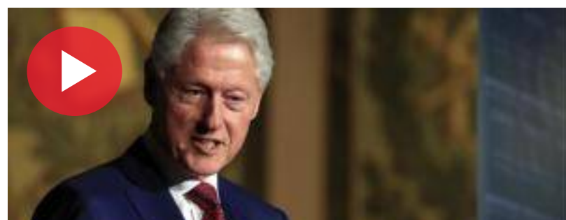
Bill Clinton suggests Donald Trump is a member of 'the dictators club'