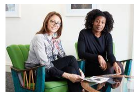
We catch up with our Invisalign participants to see how they've got on