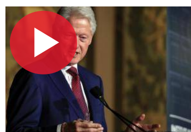
Bill Clinton suggests Donald Trump is a member of 'the dictators club'