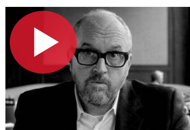
Louis CK premiere cancelled 'ahead of New York Times story'