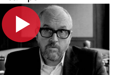
Louis CK premiere cancelled 'ahead of New York Times story'