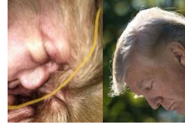
A woman found Donald Trump in her dog's ear

The easiest way to cure cancer is to prevent it. Global tobacco control is critical to achieve this goal. When lung cancer is detected at an early stage, surgery and adjuvant therapies are enough to achieve cure. But what if the patient arrives too late, having an advanced form of the disease? How can we deliver the gift of time and quality of life that my son was denied? The strategy here resides in switching from the current monotherapy rule given in consecutive lines, towards the rational combination(s) of targeted drugs. But how many drugs do we need to combine together?