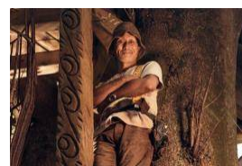
The treehouse makers living the high life