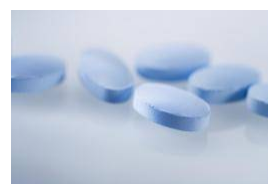
What you can do to help prevent HIV transmission