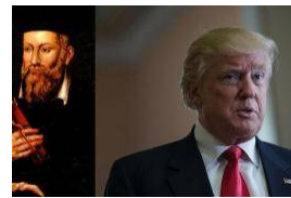
Nostradamus 'predicted' Donald Trump 400 years ago