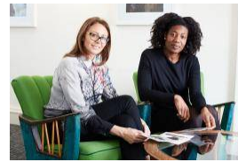
We catch up with our Invisalign participants to see how they've got on