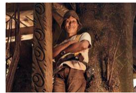
The treehouse makers living the high life